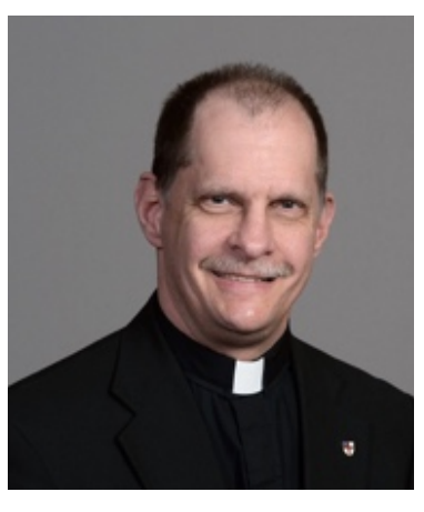
to issues we are facing.