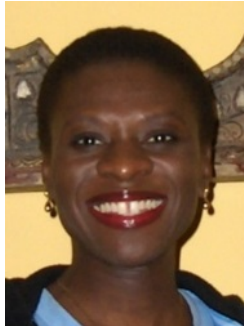
The Hon. Enechi A. Modu (2021)