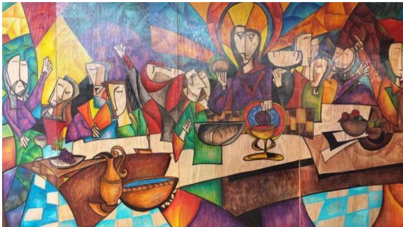
“Sacrifice,” by Tom Panej, 2013